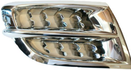
45-1629NUA Left Side